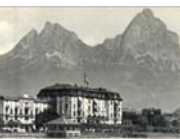
Brunnen / Vierwaldstättersee May 31 / June 01, 2011