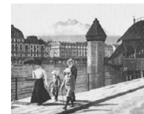
Luzern / Vierwaldstättersee September 28/29, 2011